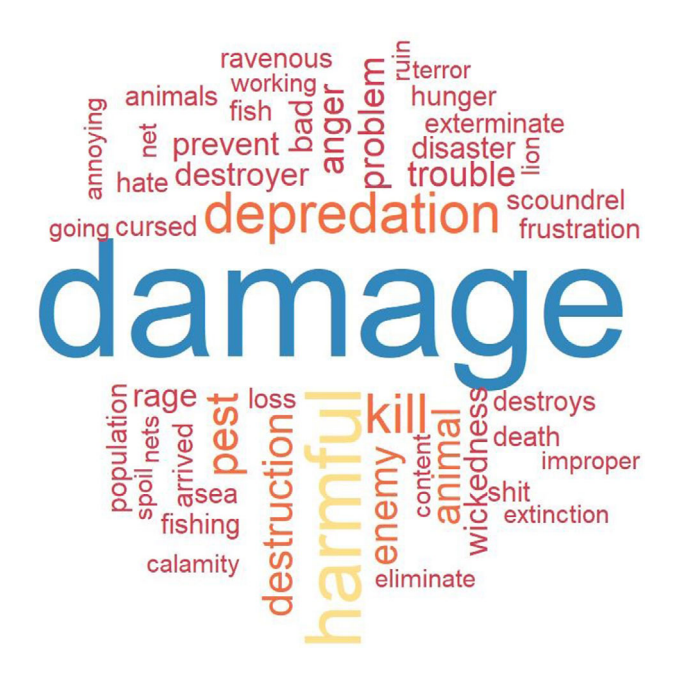
FIGURE 1 Word cloud of the first word that occurred to small-scale fishers in Peru and Chile (n = 301) when they heard the word "sea lion." Larger font size indicates a response was observed with greater frequency across the sample

Notes: Membership of preference groups was modelled probabilistically as a function of individual specific characteristics using a multinomial logit functional form. Involved in tourism and Respondents from Peru are binary variables. Impact of sea lions on earnings is a continuous variable ranging from –10 to 9, with each unit representing a 10% change in the impact of sea lions on fishing income. Confidence interval estimates are derived from 1,000,000 draws from the simulated parameter distributions, evaluated at mean class shares.