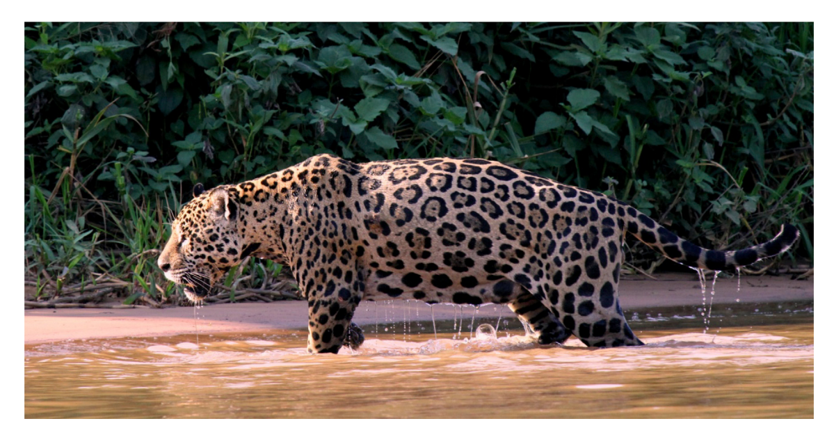
Fig. 1. An adult male of Jaguar (Panthera onca) along the margin of the Três Irmãos River, in the Encontro das Águas State Park.

observation of jaguars is the most established attraction. Other wildlife fills in the background scenario, but has a secondary role in the choice and marketing of this destination (FRT, unpublished data). Traditional ranching of adapted cattle breeds has been the most important economic activity in the Pantanal for over 250 years (Wilcox, 1992), and occupies over 80% of the biome (Seidl et al., 2001), including all ranches around the EASP area. Comparing these two main economic activities of the Pantanal, wildlife tourism is potentially more widespread because it can occur in both strictly protected areas and private landholdings (Hoogesteijn et al., 2015; Tortato and Izzo, 2017). Cattle ranching is legally prohibited in formal protected areas, such as EASP.