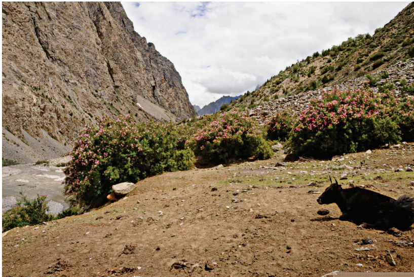
FIGURE 1 Yak on one of the summer pastures of Hushey.

domestic stock. While Himalayan ibex ( Capra sibirica ) and in some areas markhor ( Capra falconeri ) remain important food staples, along with other small mammals and birds, snow leopards feed to a large degree on domestic livestock, including yak, goat, and sheep (Mishra 1997; Anwar et al 2011).