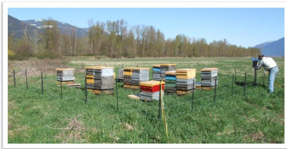
The use of electric fencing to deter grizzly and black bears from damaging a beehive operation in Canada. Electric fences are one of the most effective methods for deterring bears access to attractants.