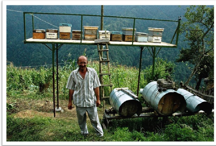
A modern adaptation of a traditional method of protecting beehives from brown bears in Turkey that makes it easier to harvest honey in a safe manner.