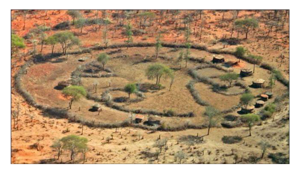
Fig. 2 Aerial view of a traditional, Maasai boma; inner, thorn ring represents the livestock enclosure