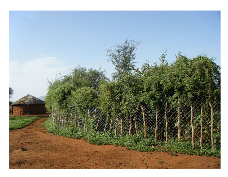
Fig. 3 A Living Wall

cattle ($450), shoats ($50) and donkeys ($200), converted at a rate of 1,550 Tanzanian Shillings to 1 US Dollar. This amounted to $19,700 in damages (assuming wounded animals died later or lost their value due to injuries). Lions were responsible for 64 % of all predator-induced financial loss or $12,550 due to their greater likelihood to kill cattle. All events took place at night except for the one jackal attack that occurred during the day. 66 % of attacks occurred during the rainy (November–April; n=37) and intermediate seasons (May–June; n=8), coinciding with the seasonal movement of wildlife outside of Tarangire National Park.