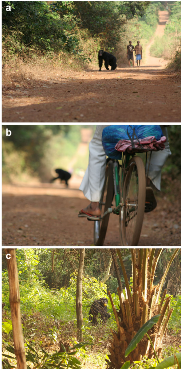
Fig. 2 a Local people and chimpanzees encountering each other on a road in Cantanhez National Park (photo by K. Hockings). b A cyclist passing a chimpanzee that is crossing the road in Cantanhez National Park (photo by K. Hockings). c An adult male chimpanzee transporting cultivated oranges in an agricultural field next to the village (photo by J. Bessa).

complexity of factors influencing the availability and management of resources in CNP, as well as limited data on overlapping habitat and resource use by people and chimpanzees, impelled us to design and implement a mixed-methods approach. We explored these dynamics from a multispecies perspective, combining ethnoprimateology with multispecies ethnography, which further integrates anthropological and biological approaches.