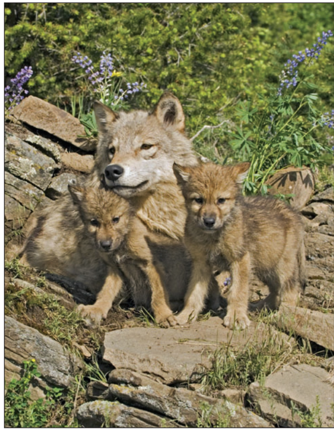
Figure 1. Female wolf with cubs. Grazing season is also wolf pup-rearing season, leading to wolf–cattle conflicts.

Large-bodied prey for wolves in this area include white-tailed deer ( O virginianus ), mule deer ( O hemionus ), elk,