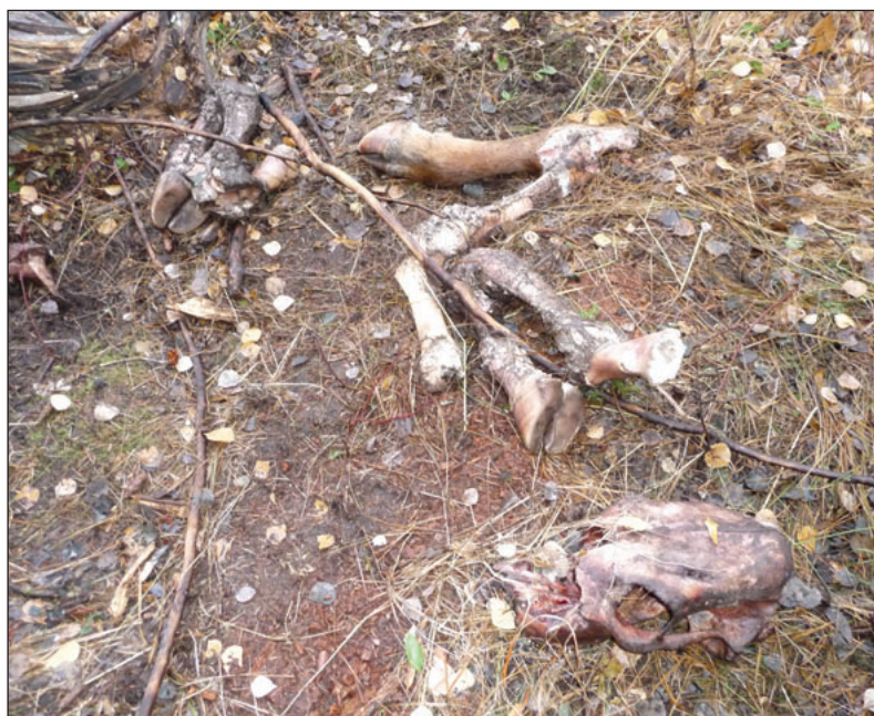
Figure 2. Cattle remains following predation by wolves.

We searched clusters in cardinal directions, following methods detailed by Knopff et al. (2009). We assigned a “kill” status to the site if we found prey remains that closely matched the time period during which wolves were present and there was evidence that the animal had been killed by wolves (Peterson and Ciucci 2003; Webb et al. 2008). We examined prey remains to identify species, sex, age, and any abnormalities. Wild ungulates were aged in the field as young-of-the-year (<1 year), yearling (>1 year but <2 years), or adult (>2 years) based on tooth-eruption patterns. Cattle ages were confirmed by the producer. Sites were classified as scavenge events if there was clear evidence the animal had not been killed by wolves (eg other predator kills, boneyards [where carcasses are dumped], hunter kills, and road kills).