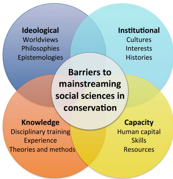
Figure 1. Barriers to mainstreaming the social sciences in conservation.

transformation of the entire approach, agenda, culture, and ethos of the conservation community.